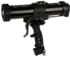
EGOFIX AIRJET KB 400

1k 400 ml 600 ml System Gebinde Gebinde 310 ml 50 mm Gebinde Gebinde