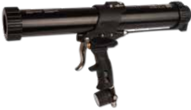
EGOFIX AIRJET KB 600

1k 400 ml 600 ml System Gebinde Gebinde 310 ml 50 mm Gebinde Gebinde