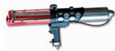
EGOFIX 2K-AIRJET DLP 750

2k 1:1 4-8 bar System Verhältnis 3,3 kN 190 ml 310 ml Gebinde Gebinde